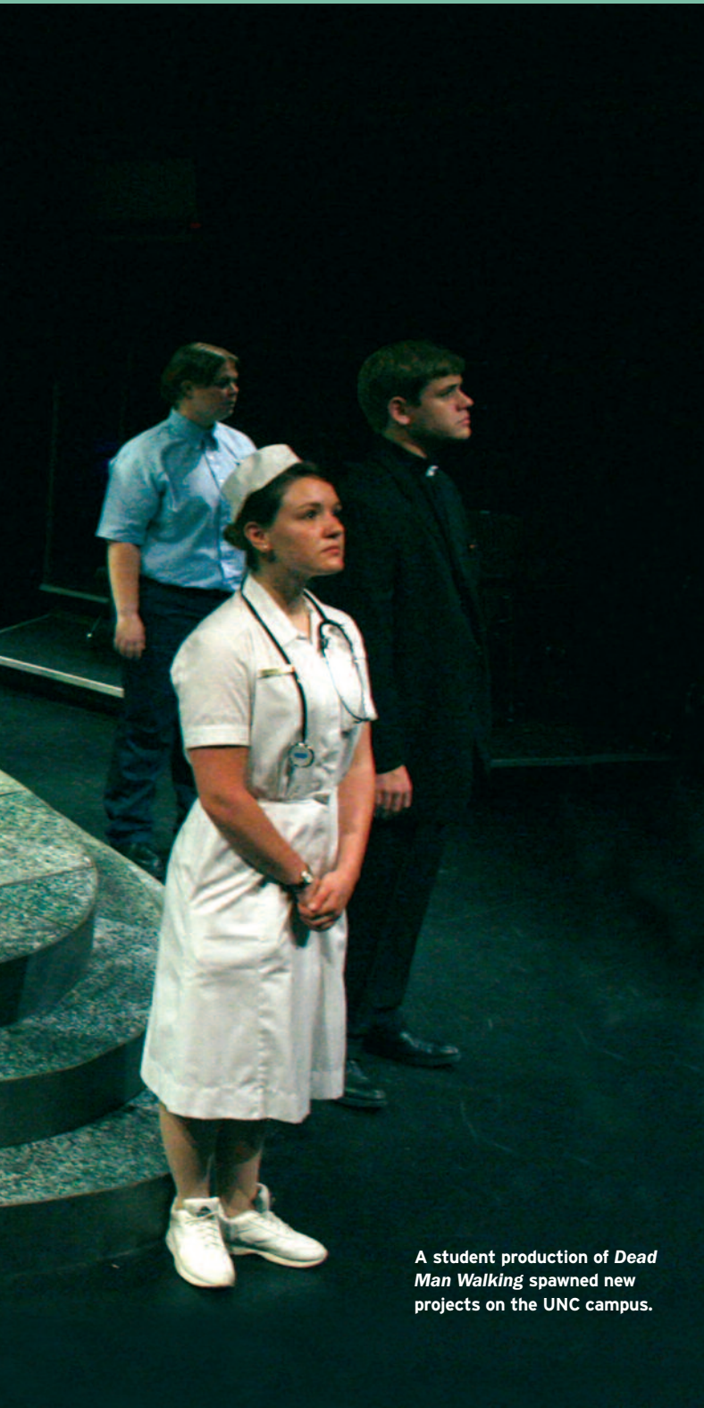
A student production of Dead Man Walking spawned new projects on the UNC campus.

Colleges and universities have been leading patrons of the arts for more than a century. Creative Campus grants reward their innovations and missions, and celebrate and assure the presence of high-quality arts in academic settings.